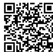
Apple iOS QR Code